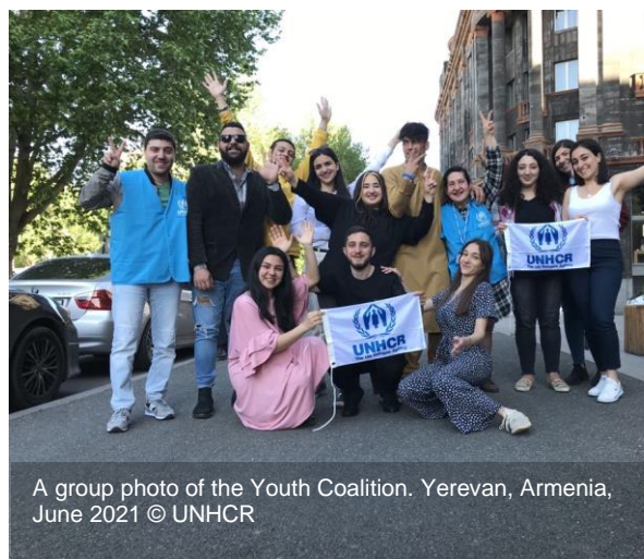
A group photo of the Youth Coalition. Yerevan, Armenia, June 2021