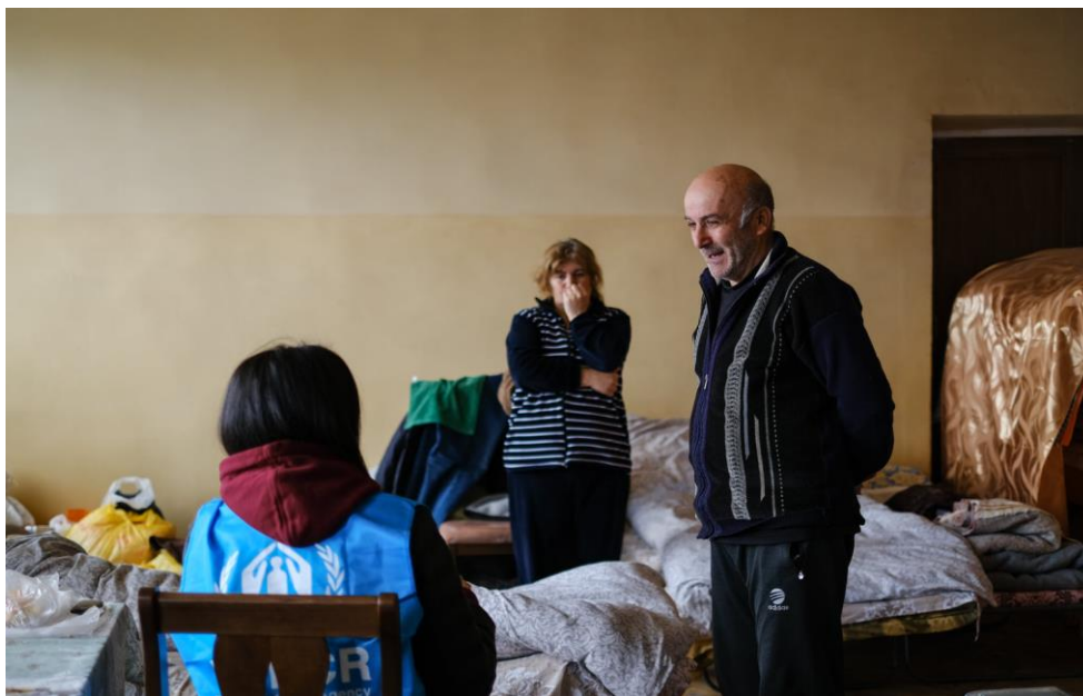
Protection monitoring with displaced persons from Nagorno-Karabakh, Goris town, Syunik Province 1-3 March 2021.

UNHCR and partners work toward enhancing the protection environment while providing assistance to those most at risk. UNHCR advocates for inclusion of persons of concern in national response plans, including COVID-19 recovery and vaccination plans, and other legislative and administrative reforms.