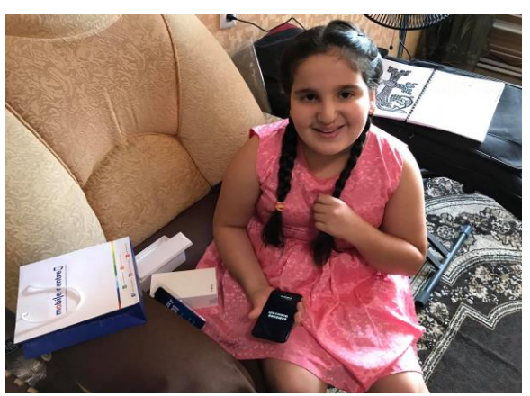
An Iraqi refugee schoolgirl starting online education owing to a digital device she received from a private donor.

The percentage funded (51%) and total funding amount ($1,867,659) are indicative. This leaves an indicative funding gap of $1,791,702 representing 49% of the financial requirements.