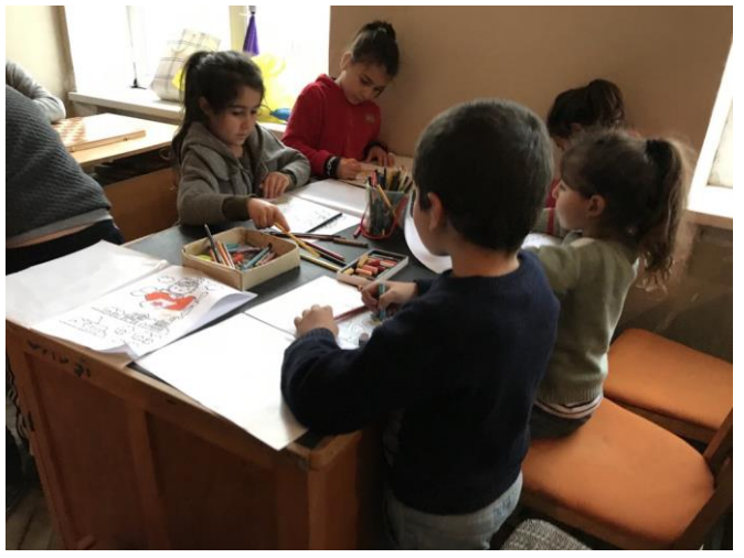
© Distribution monitoring of assistance provided by UNHCR, combined with protection monitoring Photo by Anahit Hayrapetyan, UNHCR Armenia