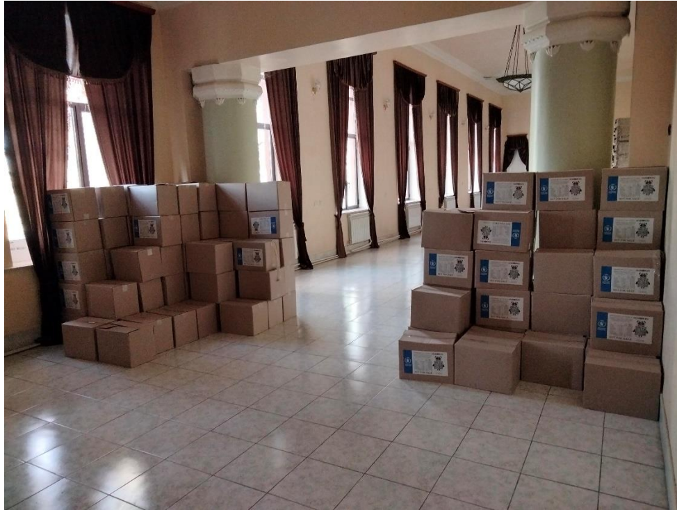
WFP ensures distribution of food packages to refugees.