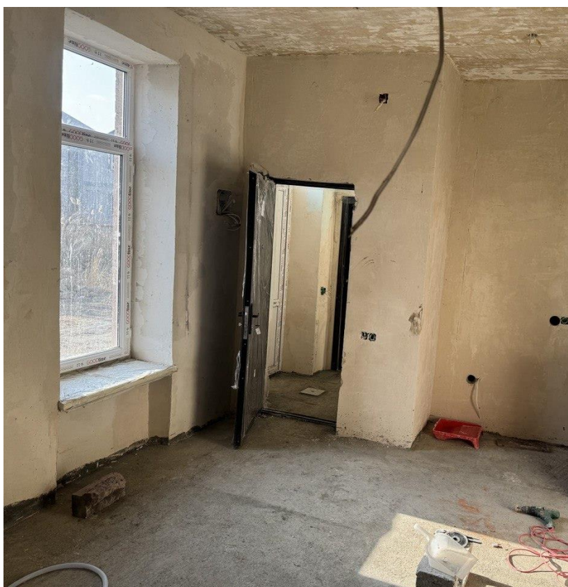
Shelter renovation is ongoing in Masis, Ararat region.