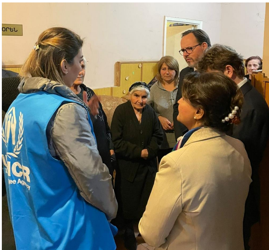
UNHCR and the French delegation is interacting with refugees living in a shelter in Masi. December 2023. Ararat region.