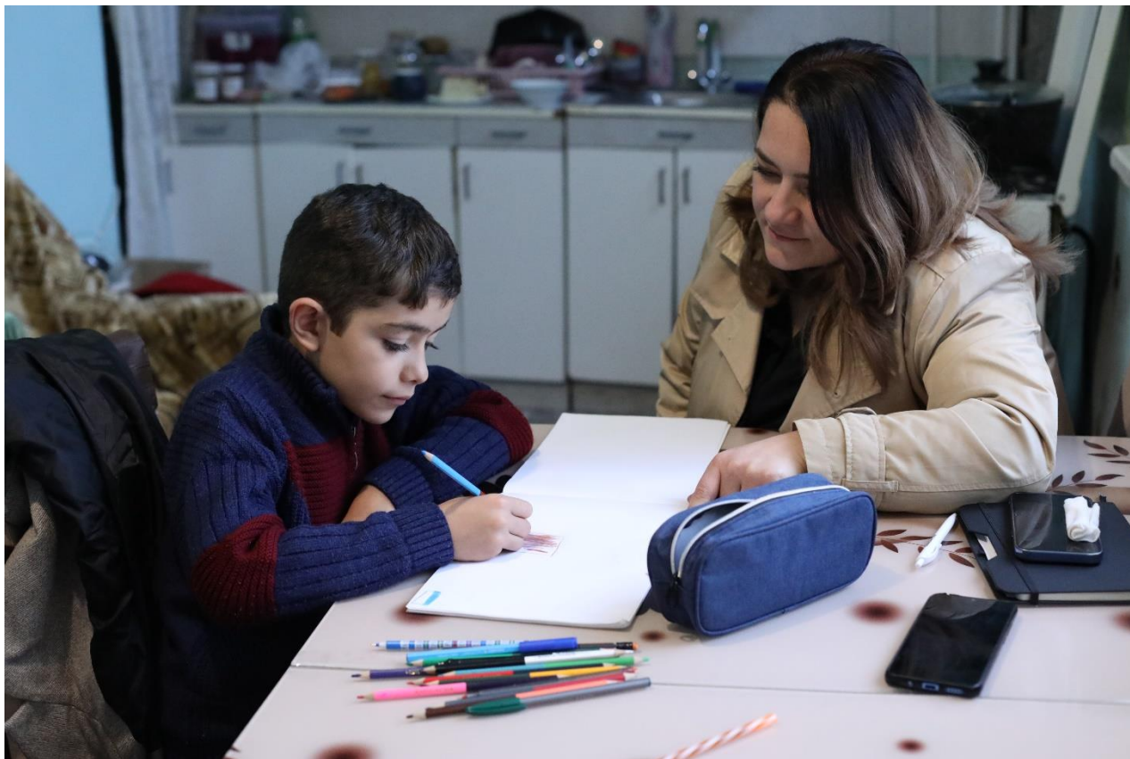
UNICEF and partners work together, psychological first aid to refugee children and their families. Abovyan, Kotayk region. December 2023