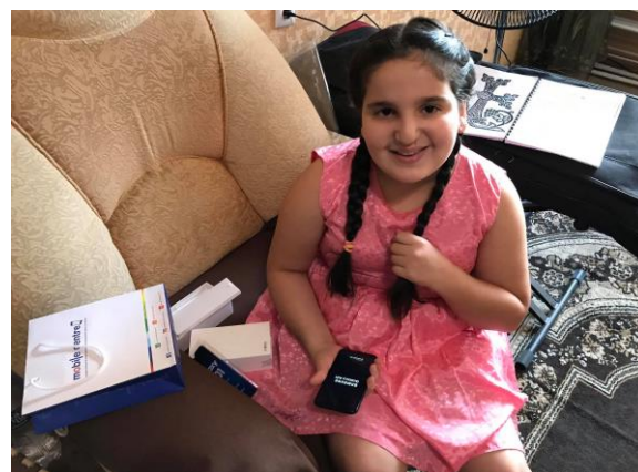
An Iraqi refugee schoolgirl starting online education owing to a digital device she received from a private donor.