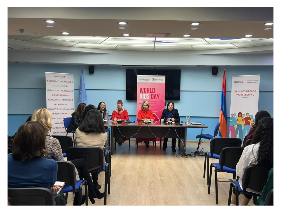
UNAIDS and WFP have joined forces with a Cooperation Agreement to ensure access to crucial care for 80 refugees living with #HIV, and to break barriers and eliminate stigma. Yerevan, Armenia.