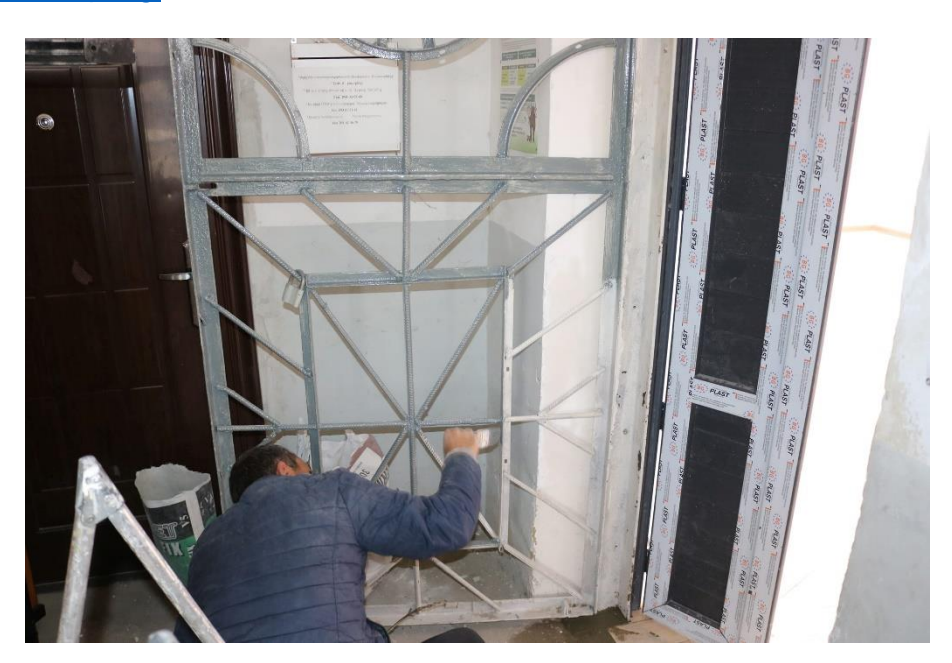
UNDP-UNHCR-supported renovation works of the community center in Verishen are close to completion. November 2023.