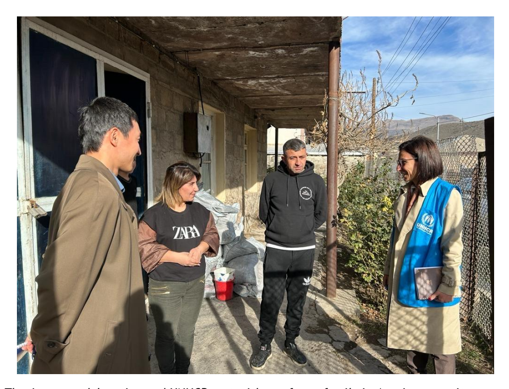
The Japanese delegation and UNHCR met with a refugee family in Areni community to learn about their well-being and evolving needs. December 2023. Vayots Dzor province.