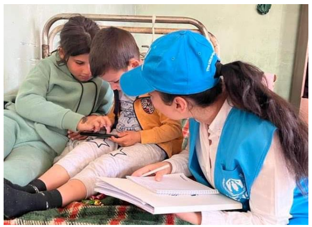
UNHCR protection monitoring team meeting with refugee family in Verin Karmiraghbyur village of Berd community.