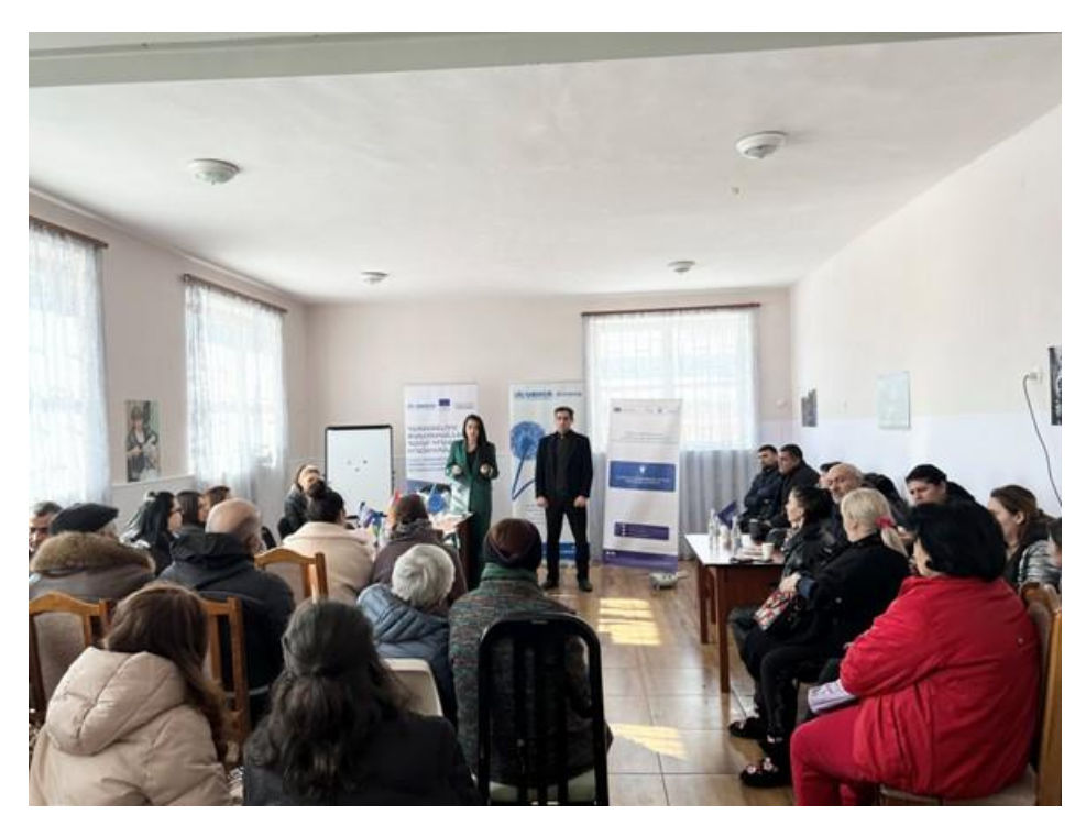
UNHCR, through the funding support of ECHO, provides legal counselling to refugees, conducted by the lawyers of partner NGO Mission Armenia. February 2024. Gyumri, Shirak province.