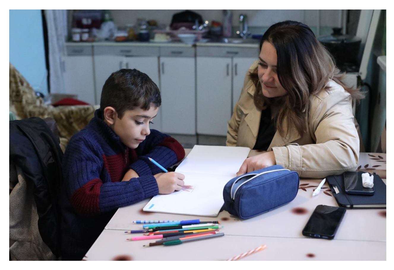
UNICEF and partners work together, psychological first aid to refugee children and their families. Abovyan, Kotayk region. December 2023

• To participate in the sector working group meeting please write to apoghosyan@unicef.org.