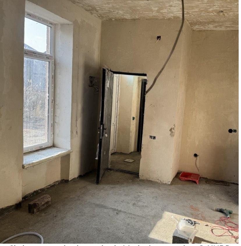
Shelter renovation is ongoing in Masis, Ararat region.