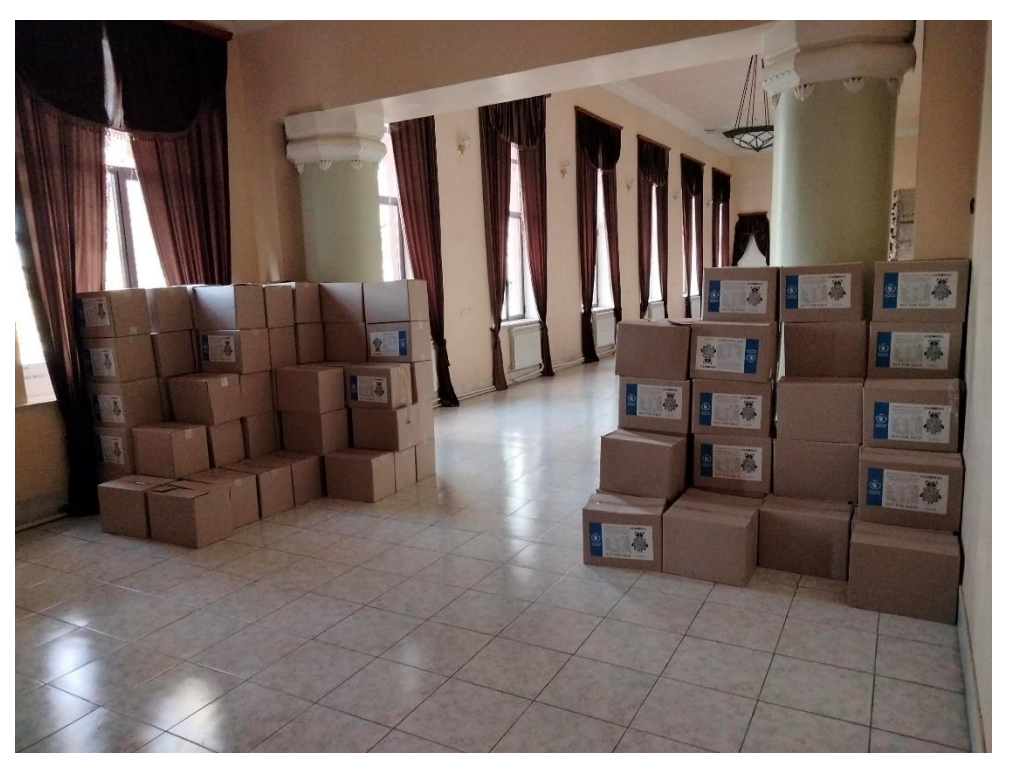
WFP ensures distribution of food packages to refugees.