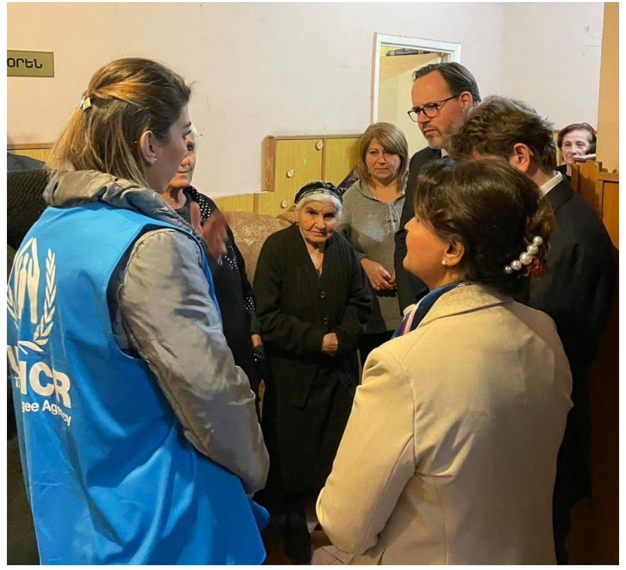
UNHCR and the French delegation is interacting with refugees living in a shelter in Masi. December 2023. Ararat region.